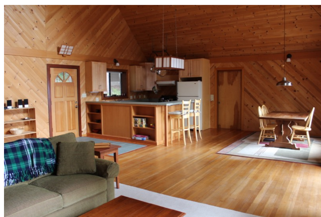
Warm and wonderful. Once used as a recording studio, the great room features lovely wood walls and floors, thick walls (great acoustics) and deep window sills with amazing views from the south side windows. The Sitting Room is a perfect spot for reading a book or jigsaw puzzle time.