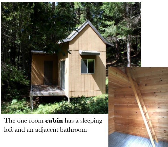
The one room cabin has a sleeping loft and an adjacent bathroom