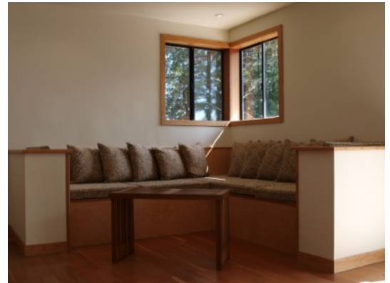
The Amazing Views can be enjoyed from the sunny deck, the Great Room, Sitting Room or Master Bedroom. Ever dreamed of opening your eyes to an unspoiled view? Dream no more! In addition to the south side deck, there is a cooler sitting spot on either the lower level deck or the access deck.