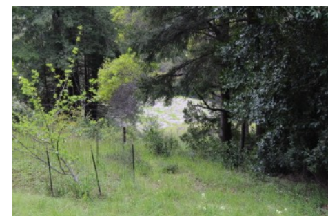
The southern exposure invites fruit trees and gardens. A sunny shelf awaits spring planting. The property is on the Grid and has an abundant residential well (2001 test - 20 gpm).